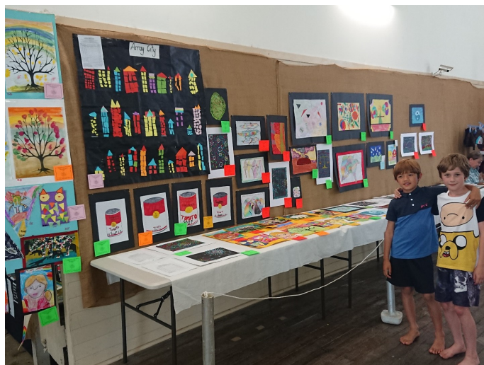
Photos: Presenting Walkathon Fundraising cheque (Top Left) Nimbin Show Primary Art Exhibit (Top Right)